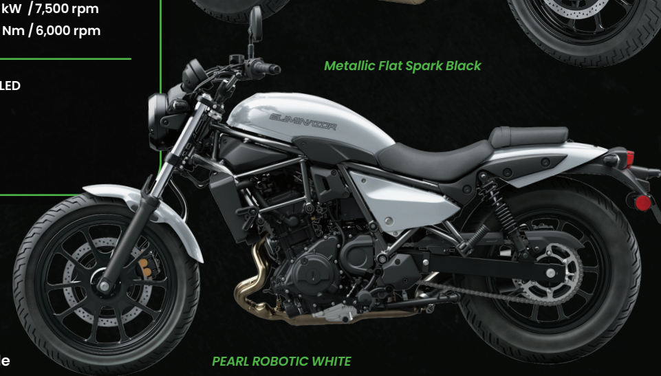
PEARL ROBOTIC WHITE

* Specifications are subject to change without prior notice