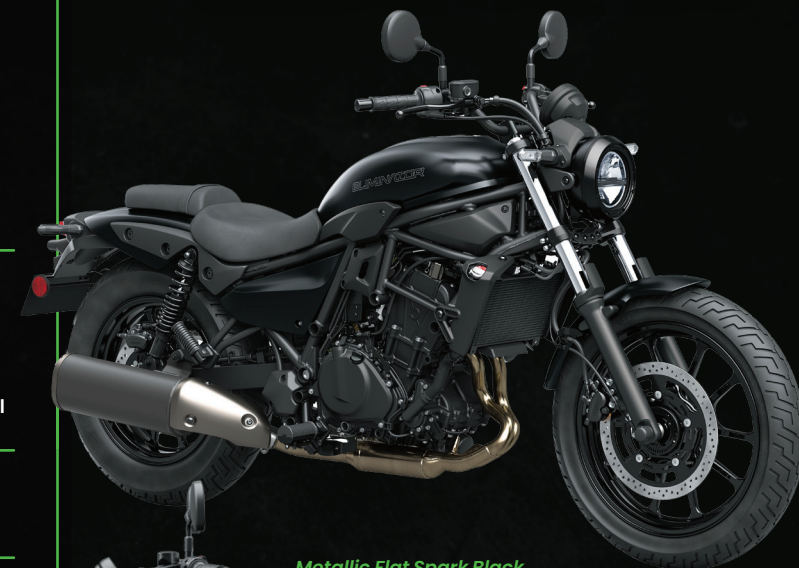
Metallic Flat Spark Black